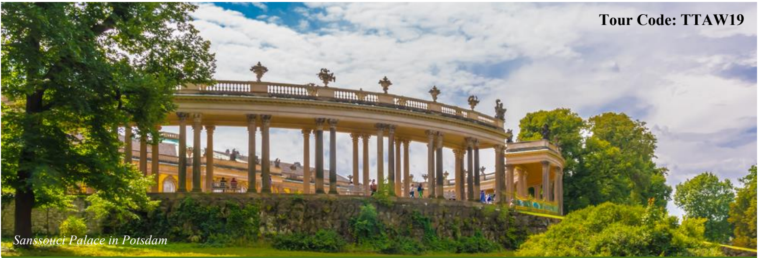
Sanssouci Palace in Potsdam