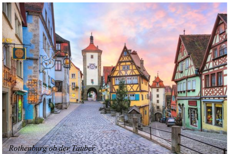
Rothenburg ob der Tauber

We start early today as there is much to see. We begin with a visit to Dornröschen Schloss Sababurg where Sleeping Beauty's Castle comes to life. Next, we stop at the fortress and town of Trendelburg, the stage of recited fairy tales and myths. Part of the mediaeval building complex is Rapunzel's Tower. Over the former drawbridge that leads across the moat leads, visitors must bend down to pass through the portal into the cobblestone fortress courtyard. From there, we see the