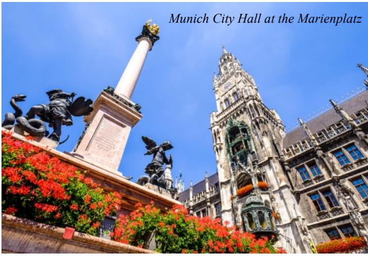
Munich City Hall at the Marienplatz