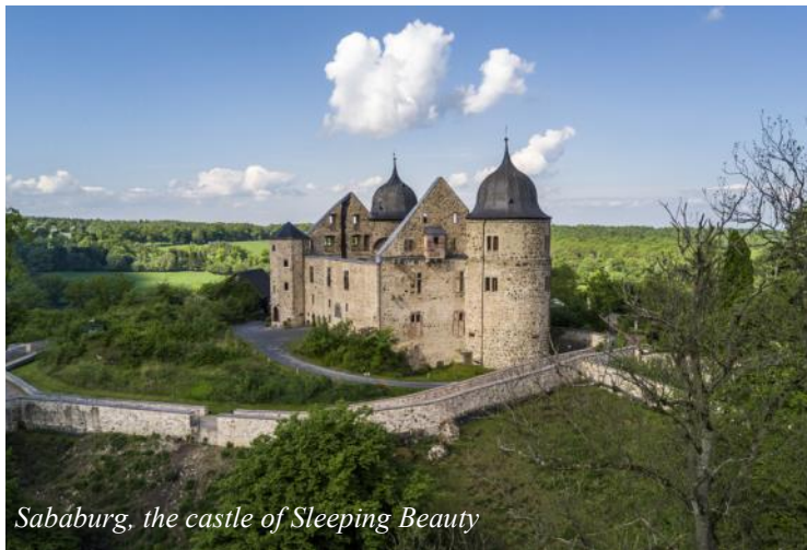
Sababurg, the castle of Sleeping Beauty

window high up above, where Rapunzel let down her golden hair. We end the day in Hamelin. B, D