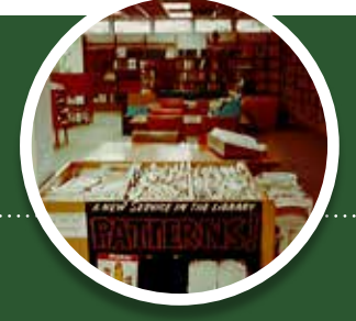
1978: GPL offered sewing patterns